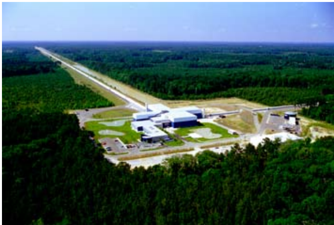
Laser Interferometer Gravitational-wave Observatory in Livingston, Louisiana. Each of the two arms is 4 kilometers long. LIGO has another such observatory in Hanford, Washington.

"The principle is simple," says Cavaglia, a member of the LIGO team. "Each LIGO detector is an L-shaped ultra-high vacuum system with arms four kilometers long. We use lasers to precisely measure changes in the length of the arms, which