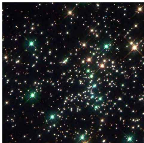
Above: Image of NGC 6397 from Hubble's Wide Field and Planetary Camera 2 ("WFPC2") combines images at ultraviolet, blue, and infrared wavelengths.

Adrienne will be talking about the results related to both of these images.