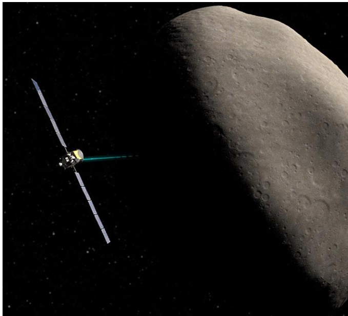
Dawn will be the first spacecraft to establish orbits around two separate target bodies during its mission—thanks to ion propulsion validated by Deep Space 1.

For example, ion propulsion technology flight-tested on the NMP mission Deep Space 1, launched in October 1998, is now flying aboard the Dawn mission. Dawn will be the first probe to orbit an asteroid (Vesta) and then travel to and orbit a dwarf planet (Ceres). The highly efficient ion engine is vital to the success of the 3 billion