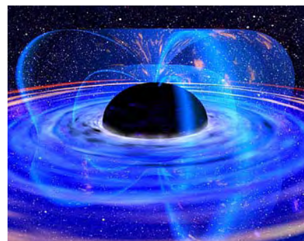
Artist's conception of a black hole.

Black holes are a perverse kind of astronomical superstar. While their existence is incredibly well-known, misconceptions about them abound more than factual data. Why do people think that the LHS could produce a black hole that could consume the planet? The goal of this talk is to clear up some misconceptions about black holes, and enlighten as to some of their more under appreciated attributes; for example, when a black hole isn't black, feeding black holes, why no one can ever see you fall into a black hole, and how a black hole can let you time-travel. A brief investigation into these fascinating members of our universe shows the boundaries of physics, common sense, and the true nature of these staples of popular culture.