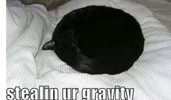
Black holes used in popular culture humor.