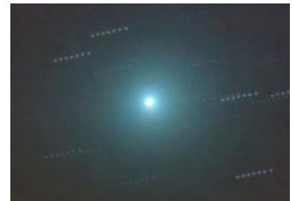
Comet Lulin.

Comet Lulin is making its way from the Sun past Earth on its way back out into deep space. In early February, the comet will be visible early mornings (around 4:00 a.m.), but you'll need binoculars. At the