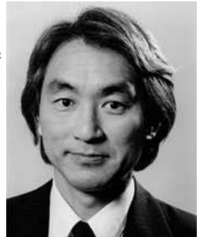
Dr. Michio Kaku

An Escape Plan at a location yet to be announced, but probably in Palo Alto. Check the Cafe Scientifique web site at: www.cafescipa.org for further updates. Register early as spots fill up fast. This group started a scientific discussion group in a Palo Alto coffee shop this past spring with Stanford Nobelist Dr. Doug Osheroff as the main guest talking about the Columbia Accident Investigation and has covered numerous other topics of interest during the year including nanotechnology and genetically modified plants just to name a few.