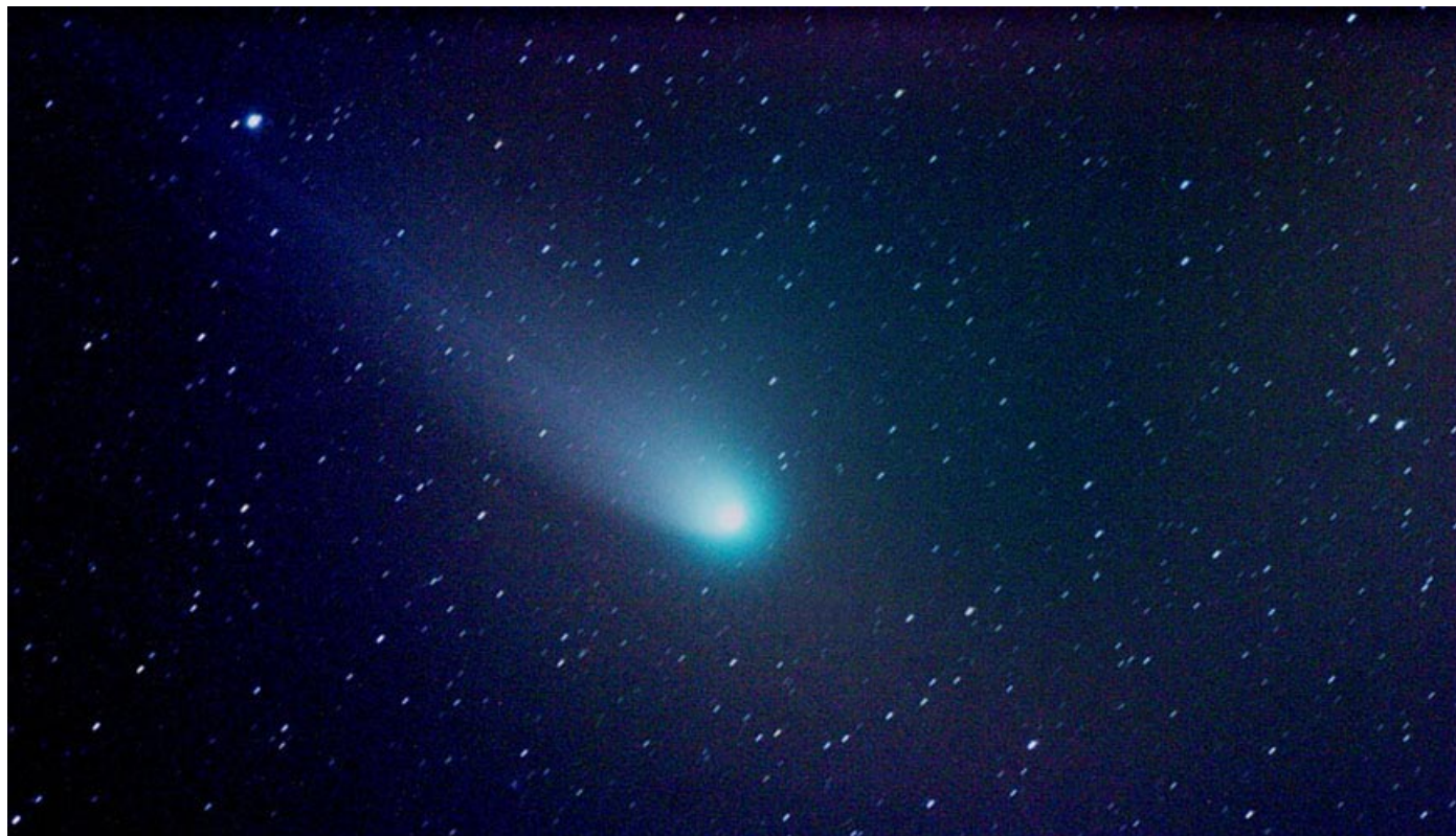
Comet C/2001 Q4 NEAT taken through a 106mm Takahashi refractor using a Canon 10D digital camera set at ISO 1600; 3-one minute exposures stacked and processed using Photoshop. Tracking was done on the nucleus of the comet which is why stars are trailed.

The last stop of the night before the moon's scheduled arrival was the Double-Double. At this point, Lyra was around 80 degrees above the horizon. But seeing was still soft; 143x gave the best view, just splitting the pairs. Any more power, and the image deteriorated. As the moon rose over the ridge to the East, we packed up and pronounced the night a success.