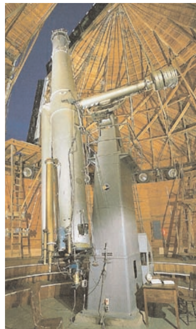
The 24" Alvan Clark refractor at the Lowell Observatory.

But if bad weather turns you into an armchair astronomer, Flagstaff is not a bad place to be. First off was a visit to the meteor crater outside Winslow, AZ, where a ~150' diameter meteor hit around 50,000 years ago. The crater—4000' diameter and 550' deep—is impressive. The museum on-site is actually fairly good, going light on the sensationalism of “sudden impacts” and focusing more on the science of meteors. There is a discussion on other impacts, both real (Yucatan, 65 million years ago) and hypothesized (impacts ~225 million and ~500 million years ago). There is also an exhibit on the Near Earth Object Search (“NEOS”) program, which attempts to identify near-earth orbiting bodies and predict the relative risk they pose to earth. Eugene Shoemaker, the astronomer, has connections to the crater (his paper, “First Natural Occurrence of Coesite” is based on research at the crater), as does the noted architect Philip Johnson (his design for the museum won out over Frank Lloyd Wright's design).