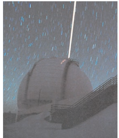
The Keck II telescope's "first light" using the laser guide star, December 23, 2001.

Our speaker for tonight served as the laser guide star project leader at both Lick and Keck Observatories.