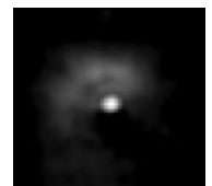
Protoplanetary disk surrounding a star in the Trapezium in Orion.