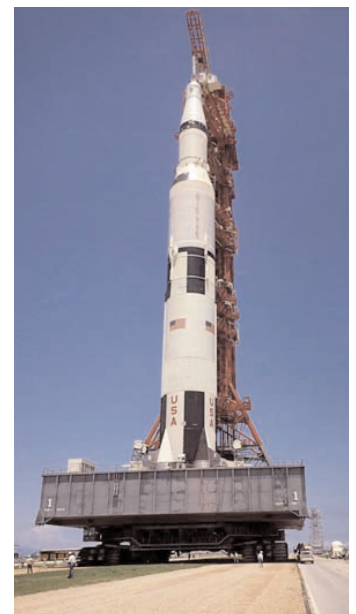
The Saturn V and Mobile Launch Platform are carried to the launch pad on the Crawler Transporter. Notice the tiny humans below the platform.

This article was provided by the Jet Propulsion Laboratory, California Institute of Technology, under a contract with the National Aeronautics and Space Administration.