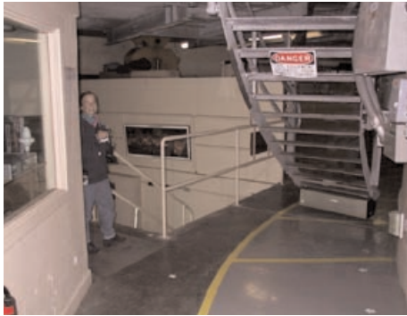
The yellow line on the ground marks the gap between the telescope and the building. Sibylle is standing to the left. G. Gottschalk

of the dome as from wind loads to be transferred to the telescope which is held perfectly pointed to the celestial object under study.