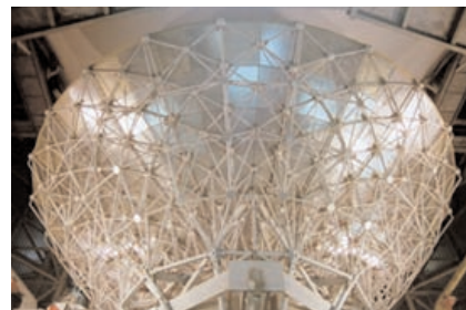
The whole dish.