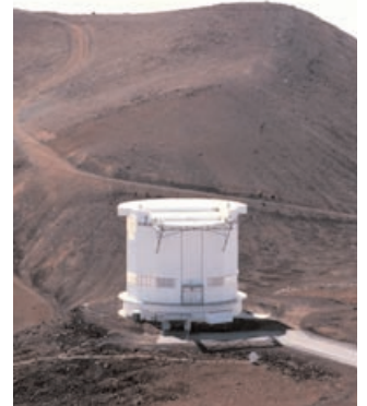
The James Clerk Maxwell Telescope on top of Mauna Kea in Hawaii. G. Gottschalk

The JCMT currently is the largest Radio telescope dedicated to millimeter and sub-millimeter radio astronomy. The range of frequencies covered extends from 0.3mm to about 2mm. The receiver dish has a diameter of 15m and consists of 276 individually adjustable aluminum panels that give it the near perfect parabola shape needed to image the sky in radio waves. The dish is supported by a massive truss support structure that minimizes flexure of the dish when moving across the sky. The moving mass of the telescope is about 70 tons which is tracking the sky in sub arc second accuracy.