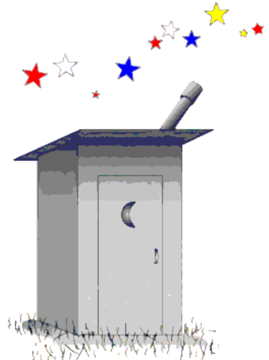
The TVS time machine by Debbie Dyke

A brief case sized and wight 6 inch F# 8 telescope. It is an innovative collapsible carbon fiber truss. I'll also be talking about a new testing method used to test the mirror the "lateral wire test".